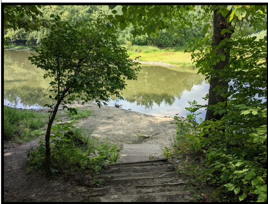
Before, Summer 2023

As temperatures begin to warm, and actually stay warm without the return of winter, we begin to start thinking of all the spring and summer time activities to look forward to. One popular activity in Bremer County is utilizing the wonderful Cedar River that passes through. Visitors to Cedar Bend Park will be treated to a new upgrade once the park officially opens on May 1. Over the years, including several rounds of highwater events, the lower steps to the canoe/kayak launch to the Cedar River washed out, making it difficult and unsafe for those wanting to utilize the site. The original railroad tie steps were installed in the 1990's by workers through the Iowa Conservation Corps. These steps had served very well for the past 30 years, however over time, portions deteriorated. The Bremer County Conservation Board knew the river access had to be addressed and sought financial assistance through a Bremer County Community Endowment grant for needed repairs. Fortunately, the grant was successful and the project would move forward. Instead of walking up and down nearly 40 wooden steps carrying a canoe or kayak, a concrete "S" shaped walkway now leads you down to the river. Staff members still plan to do some additional landscaping to the site and plan on adding a handrail alongside the concrete path