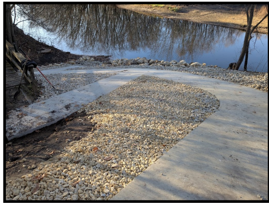
After, Fall 2025